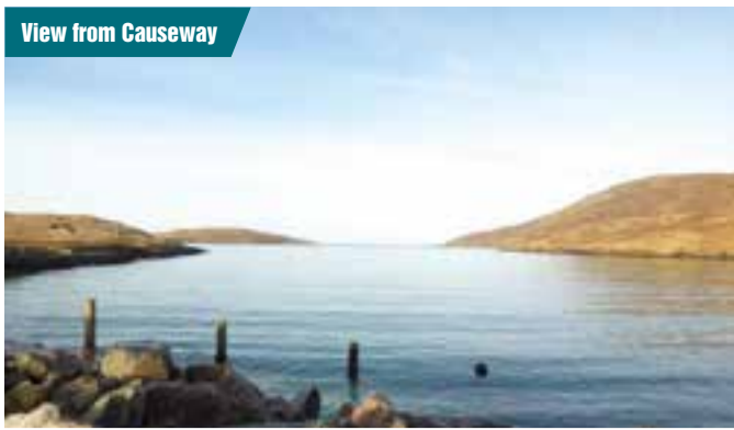
View from Causeway

You are now cycling on part of the Hebridean Way Cycling Route (NCN Route 780) which runs from Vatersay to the Butt of Lewis. From Nasg, you have wonderful views over the small, enclosed Bagh Beag and can enjoy a stunning sunrise if you are there at the right time. You will soon pass through Nasg and start to climb up round the flanks of Beinn Tangabhal on the road built in 1990 to link with the Vatersay Causeway.