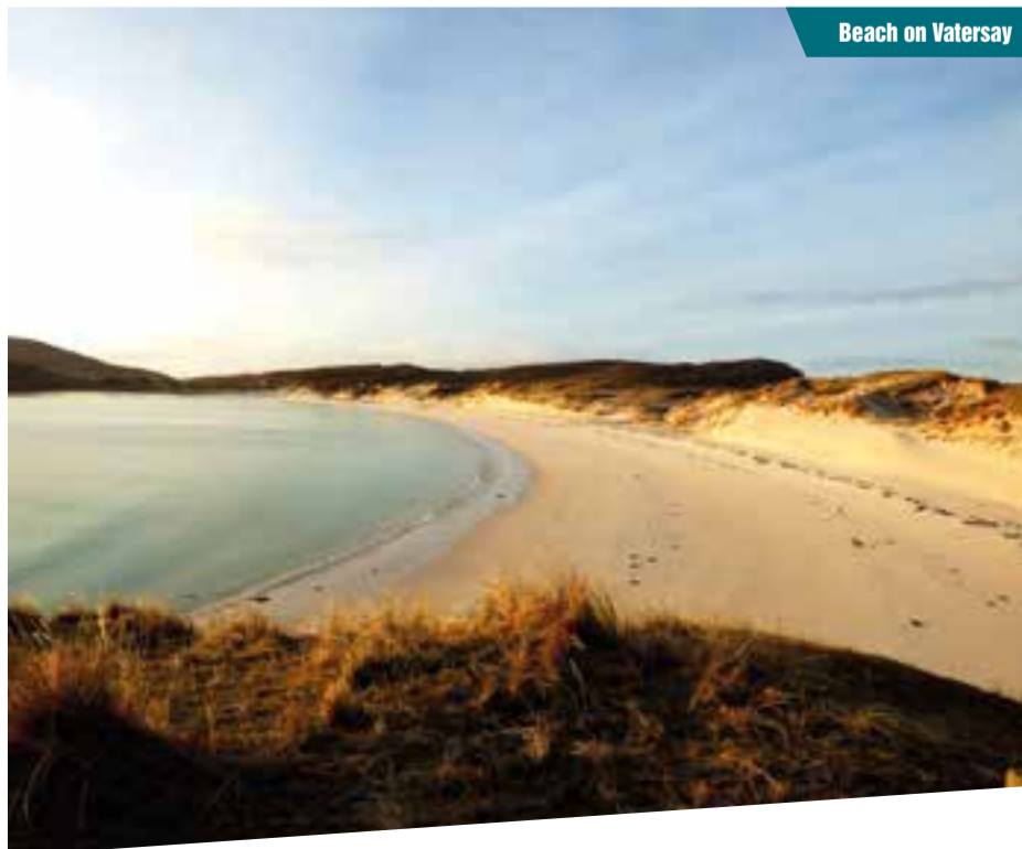
Beach on Vatersay

“you have wonderful views over the small, enclosed Bagh Beag and can enjoy a stunning sunrise if you are there at the right time.”